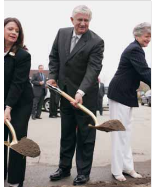
Senator Don White and Murrysville Mayor Joyce Somers (right) turn shovelfuls of dirt during the groundbreaking ceremony for the B-02 project in Murrysville.

Completion of B01 sets the stage for the start of work on the $43.9 million B02 stage. Under this project, approximately 4.1 miles of Route 22, from just east of the Cozy Inn cut-off to the Route 22/66 interchange, will be widened to provide four traffic lanes with a median divider. Openings in the median will be provided to allow for left turn lanes at intersections.